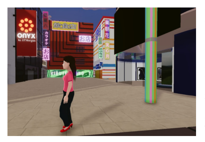
Fig. 5. JP Morgan's virtual property in Decentraland

Musings on the Metaverse and on how the Internet of Digital Reality Encompasses Future Developments of the Internet