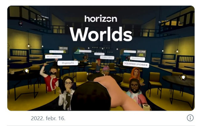
Fig. 1. Promoting Tweet of Horizon World

It's time. 10,000 worlds have already been created. Drop in and play, build or just hang out. The possibilities are endless.