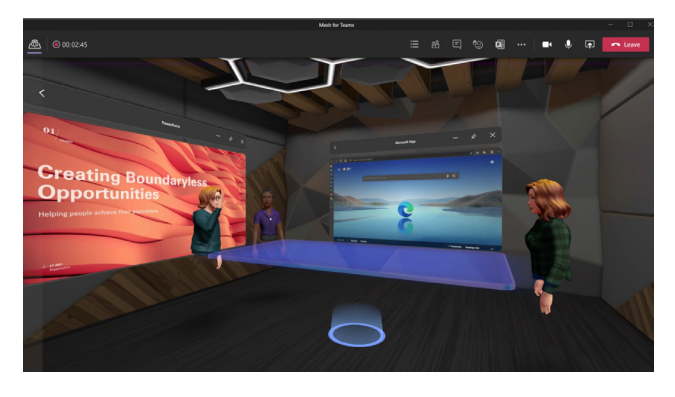
Fig. 2. Virtual meeting places in Teams 2022

Meta's AI Research Supercluster (RSC) computer system will serve to handle communication among tens of thousands of users, including sophisticated content filtering and moderation. Currently, the cluster uses 6800 graphic processors, and can complete machine vision tasks 20-times faster than the competitors. When completed, it will have 16,000 GPUs, one exabyte of memory, and will perform AI learning at 16 TByte/sec speed. VR support for Messenger has been launched already, and voice calls will be included with the system in the near future.