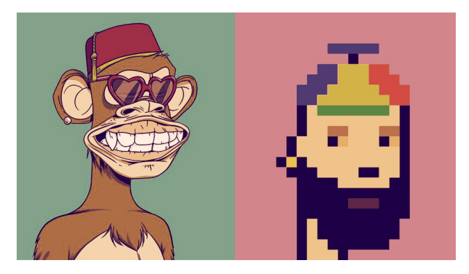
Fig. 7. A Bored Ape and a CryptoPunk: the most popular and largest Ethereum profile picture projects based on NFT.

Decades ago, VR spaces and the underlying technologies were science fiction, and simply reflected how authors imagined the future. In the meantime, a parallel but synergic evolution of various technologies offer a new, combined reality