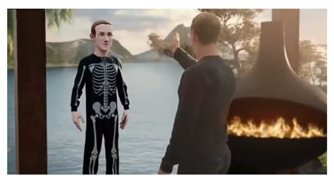
Fig. 3. In Meta's Metaverse, people create avatars of themselves with specific facial expressions or skin colors. The Cambria headset is specifically designed and it will includes sensors that enable a user's avatar to make natural eye contact in real time.

Musings on the Metaverse and on how the Internet of Digital Reality Encompasses Future Developments of the Internet